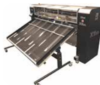
Table for copies collection (optional)