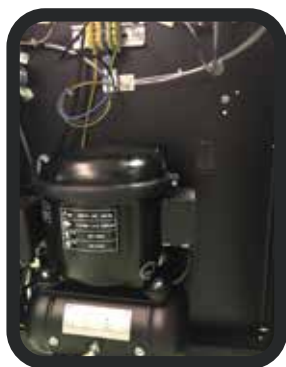
Silent compressor inside the machine