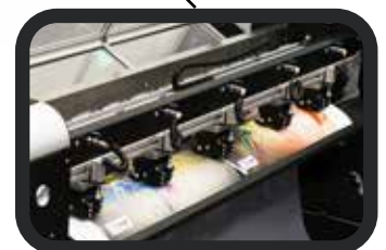
Double central cutting units (optional)