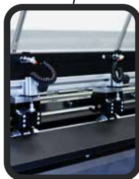
Pneumatic vertical cutting units