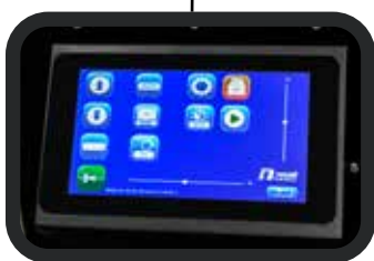
LCD Touch Screen Display