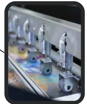
Pneumatic Pinch Roll